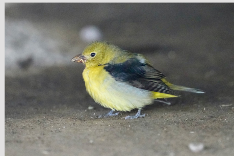
Scarlet Tanager

As we truly enter winter, local birders are best advised to look for raptors in the open country, waterfowl on whatever open water remains, and birds attracted to feeders and fruiting shrubs and trees. It remains to be seen if "winter finch" (e.g., Redpoll ) numbers will pick up. There have been relatively small numbers of Bohemian Waxwings reported prior to the first CBC weekend, but we would expect those to increase, as there appears to be no shortage of mountain ash fruit for them to find. Watch for Merlins attending the flocks!