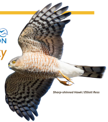
Sharp-shinned Hawk