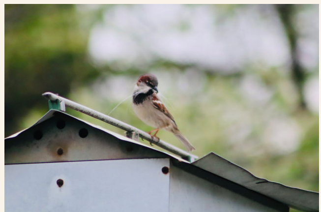
House Sparrow

Birds inspire me. If I were a bird, I would fly.