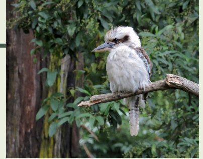
Laughing Kookaburra